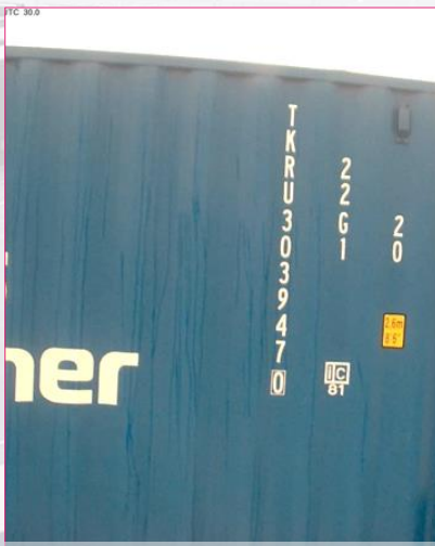
SIDE CONTAINER NUMBER