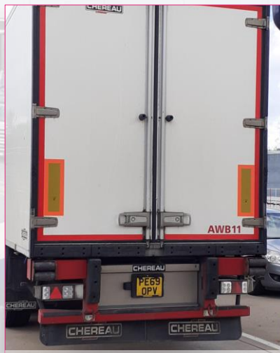
REAR CONTAINER NUMBER